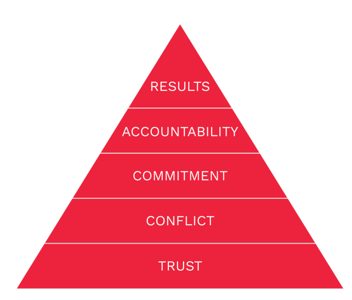
The Five Behaviors model

Since first leading Acelity's Global Clinical Affairs department through their initial Five Behaviors session, both of the original facilitators have stayed close to the group by continuously checking in, helping the department integrate new members into the team, and conducting follow-up sessions in between. In August 2019, they decided to initiate another Progress Report in order to compare results against the 2018 findings. When the results of the newly-unveiled progress report displayed an all-green triangle (signifying that the department achieved substantial improvement), everyone celebrated.